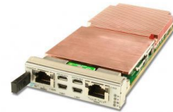
AMC723 Xeon E3-1125 Processor AMC