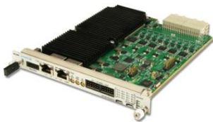
AMC520 250 MSPS DAC Converter