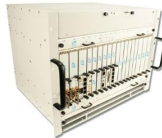
VT891 U4 Chassis