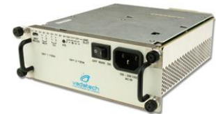
UTC018 1000W Power Module