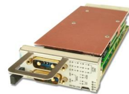
UTC020 Power Module for μTCA Chassis