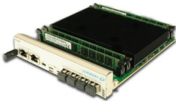
AMC740 Tiler PrAMC