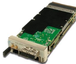
UTC004 MCH for μTCA Chassis (3rd generation)