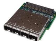
FMC109 Quad SFP+ FMC