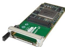
AMC532 Stratix-V FPGA