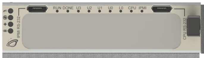
Figure 3: Front Panel