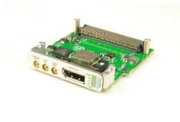
FMC223 High Speed FMC for DAC