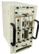
VT899 Cube Chassis