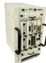
ARP200 FPGA Application-Ready Platform