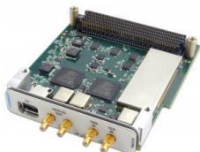
FMC219 High-speed Dual DAC 14-bit 2.5 GSPS