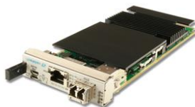
AMC713 Processor AMC