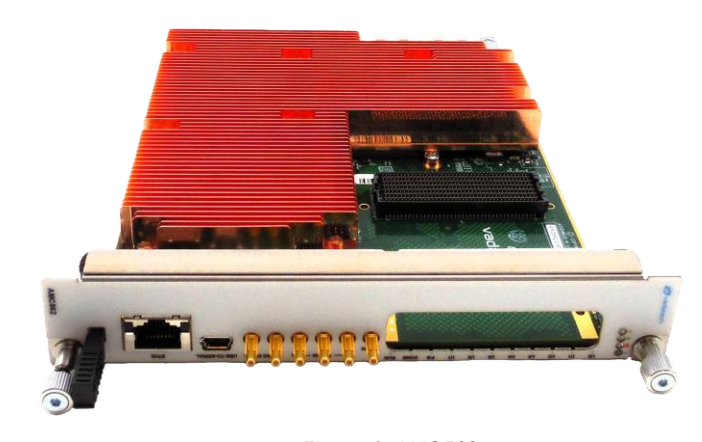
Figure 1: AMC562

The Module has 64 GB of Flash, 128 MB of boot flash, and an SD Card as an option. In addition, the module has three inputs and two outputs via SSMC connector.