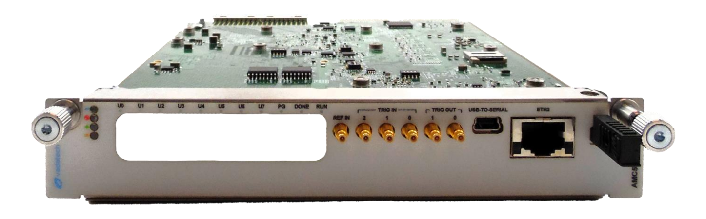
Figure 3: AMC562 Front Panel View