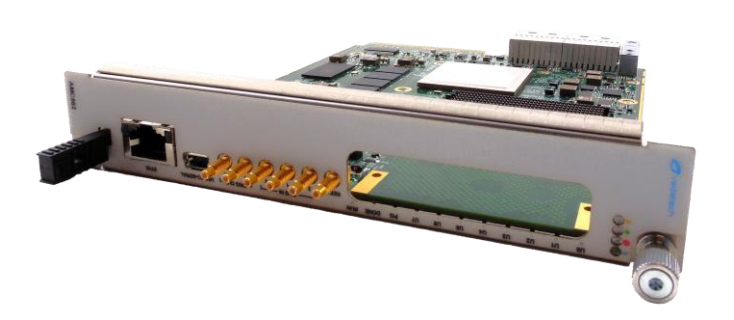
Figure 2: AMC562 without Heatsink