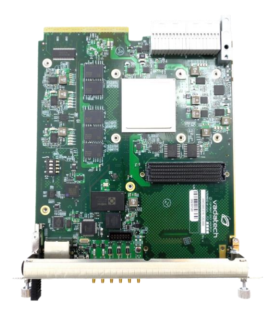
Figure 3: AMC566 Bottom View, no Heatsink