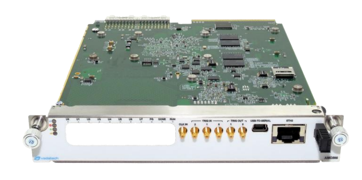
Figure 1: AMC566

*Some of the pins do not follow exactly to the D1.4 (OUT0+/-, OUT1+/-, OUT2+/- are LVDS and can be configured as input/out by FPGA).