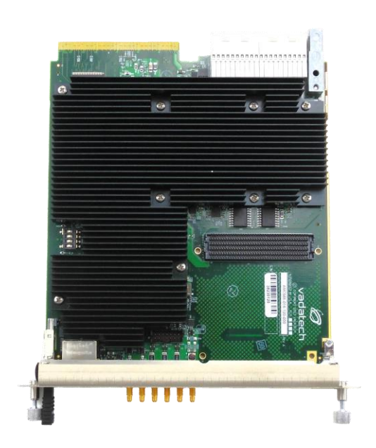
Figure 2: AMC566 Bottom View