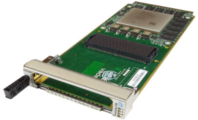
Figure 1: AMC585

The module has on board 64 GB of Flash, 128 MB of boot flash and an SD Card as an option.