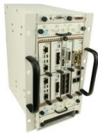
VT899 Cube Chassis