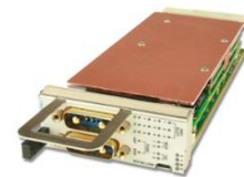
UTC020 1000W Power Module