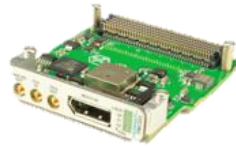
FMC223 High Speed FMC for DAC