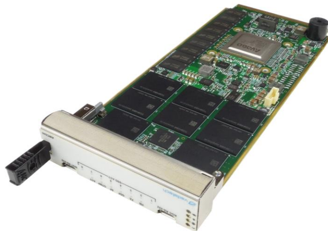
Figure 1: AMC645

The AMC645 is available in both air-cooled (MTCA.0 and MTCA.1) and rugged conduction-cooled versions (MTCA.2 or MTCA.3, contact sales for details).