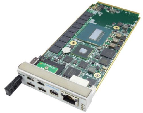
Figure 1: AMC726

Linux OS is standard on the AMC726, consult VadaTech for other options.