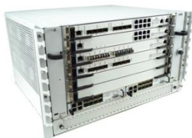
VT830 6U ATCA Slot Saver Chassis