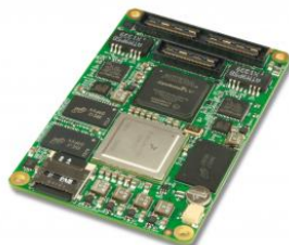
VT003 ATCA Shelf Manager - 3rd Generation