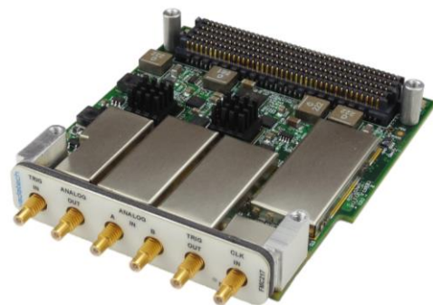
Figure 1: FMC217 Front View

The module allows one of the inputs to be configured as Trigger Input or Output. Further the ADC TMSTP signal input source could be configured to come from the FPGA or the Trigger In.