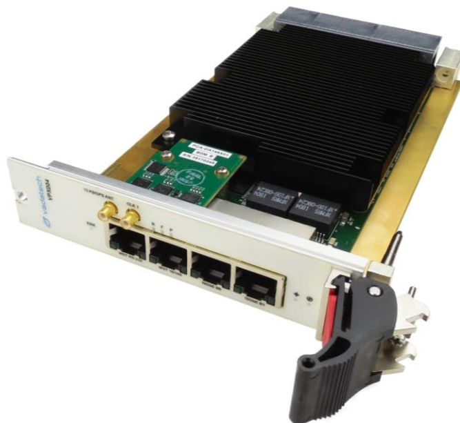
Figure 1: VPX004

VPX004 provides optional Master JTAG services to the payload modules via the JSM and has advanced clocking features including grand master clock and high-quality clock distribution/synthesis.