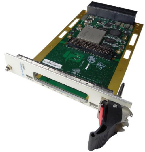
Figure 1: VPX517

Please contact VadaTech for details of Conduction Cooled versions.