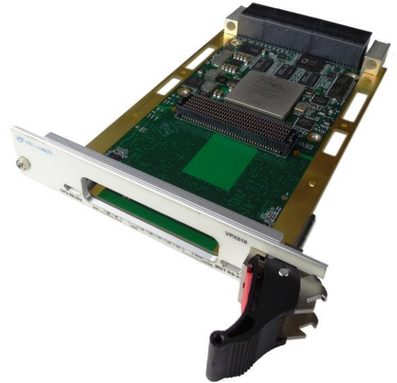
Figure 1: VPX518

Please contact VadaTech for details of Conduction Cooled versions.