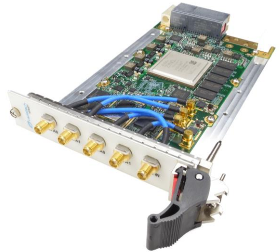
Figure 1: VPX571

The module has on board 64 GB of Flash, 128 MB of Boot Flash and an SD Card as an option.