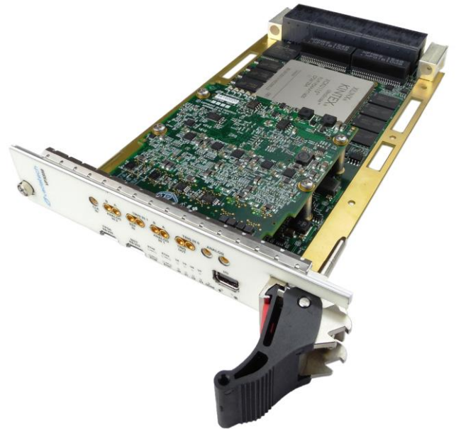
Figure 1: VPX599A

Note: The difference between the VPX599 and VPX599A is I/O routing to the P1/P2 connector of the VPX, otherwise the boards are identical.