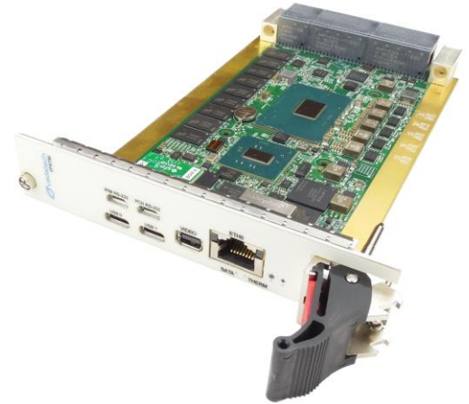
Figure 1: VPX756

Linux OS is standard on the VPX756, consult VadaTech for other options.