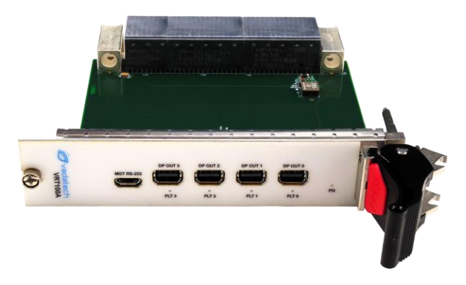
Figure 2: VRT100A Front Angle