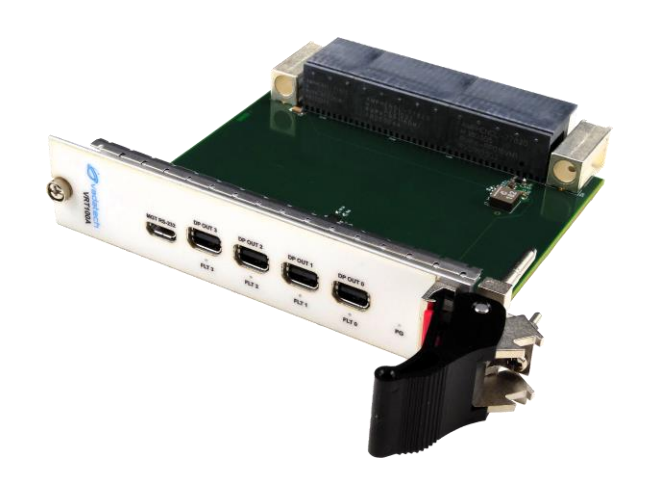
Figure 1: VRT100A

Quad Display Port are routed to the rear transition module (RTM) from the front module (VadaTech VPX100 GPGPU).