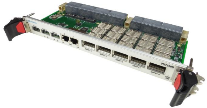
Figure 1: VRT550B