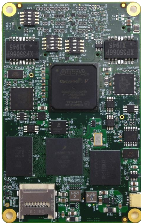
Figure 2: VT040R Top View