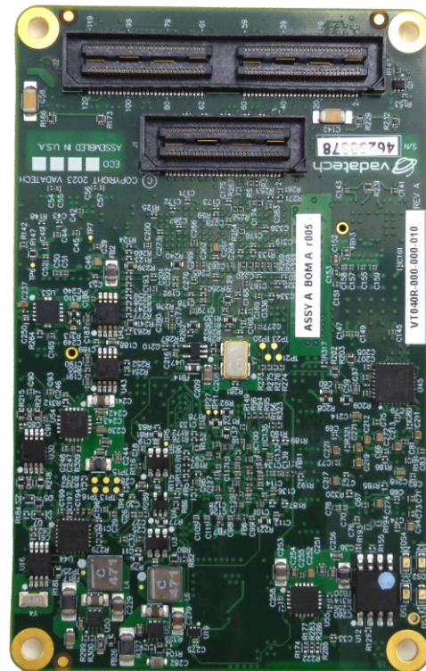
Figure 3: VT040R Bottom View