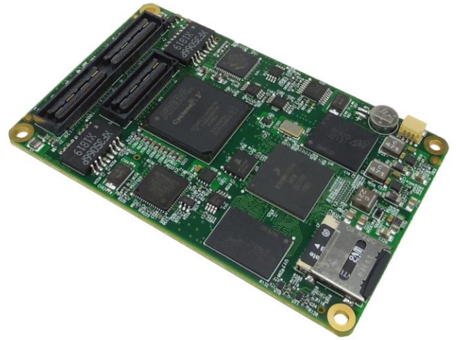
Figure 1: VT040

VadaTech's Scorpionware™ software can be used to access information about the current state of the Shelf or the Carrier, obtain information such as the FRU population, or monitor alarms, power management, current sensor values, and the overall health of the Shelf. The software GUI is very powerful, providing a Virtual Carrier and FRU construct for a simple, effective interface.