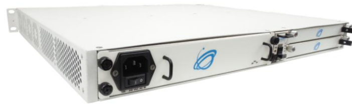
Figure 2: VT817 Rear View