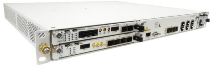
Figure 1: VT817 Front View

VadaTech's Scorpionware software can be used to access information about the current state of the Shelf or the Carrier, obtain information such as the FRU population, or monitor alarms, power management, current sensor values, and the overall health of the Shelf. The software GUI is very powerful, providing a Virtual Carrier and FRU construct for a simple, effective interface.