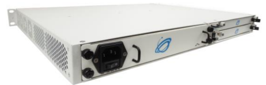
Figure 2: VT819 Chassis Rear View