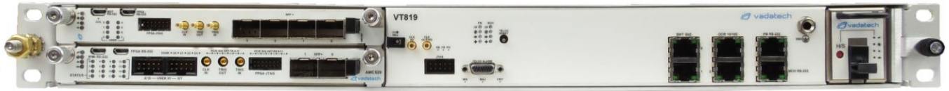
Figure 5: Chassis Layout Front