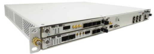
Figure 1: VT819 Chassis Front View

There is an optional JTAG Switch Module to provide JTAG access to the front.