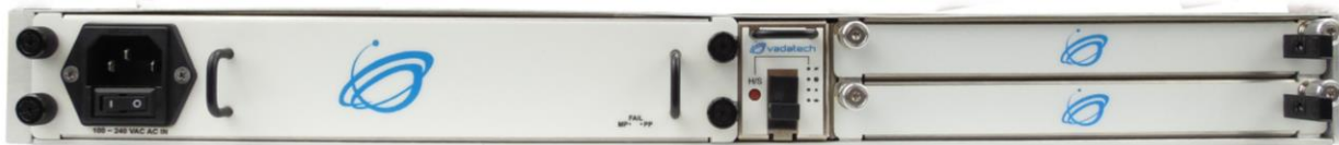
Figure 6: Chassis Layout Rear