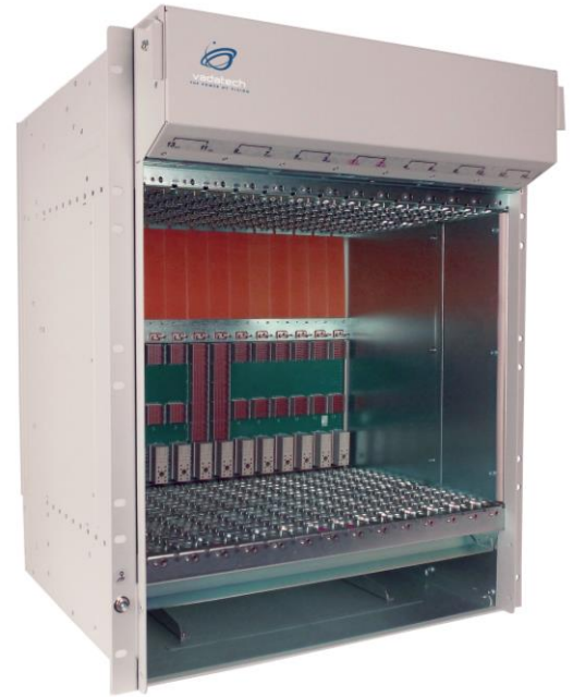
Figure 1: VT825