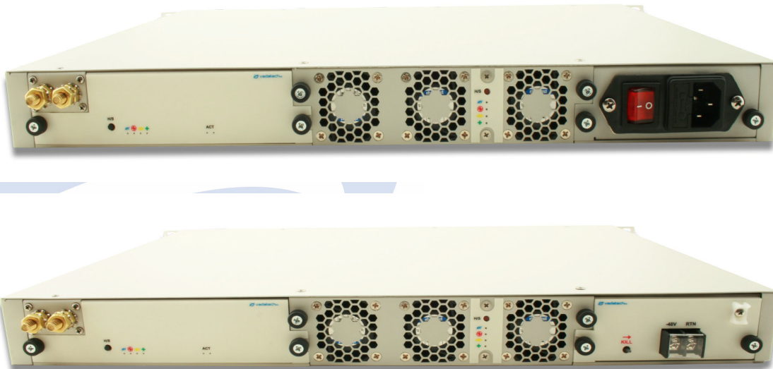
Rear view with AC and DC power supply option

*If two disks are ordered, they will be identical.