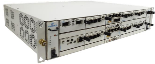
Figure 1: VT882 Chassis

Unlike other MTCA chassis on the market, the VT895 has no active components on its back plane, making maintenance and servicing tasks more straightforward.