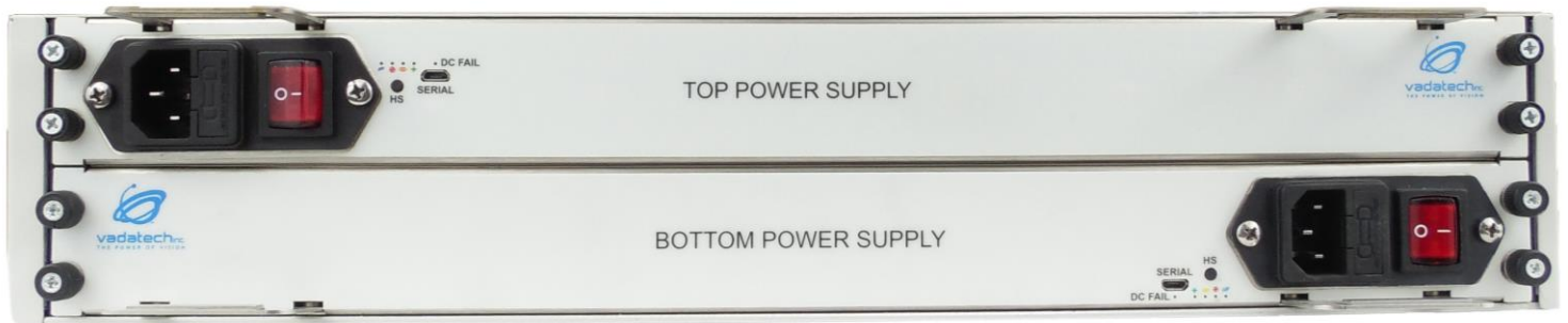
Figure 4: VT882 Chassis Rear View