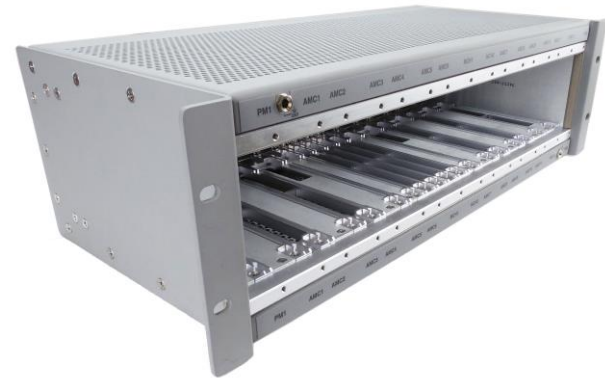
Figure 1: VT819 Chassis

VadaTech's Scorpionware software can be used to access information about the current state of the Shelf or the Carrier, obtain information such as the FRU population, or monitor alarms, power management, current sensor values, and the overall health of the Shelf. The software GUI is very powerful, providing a Virtual Carrier and FRU construct for a simple, effective interface.