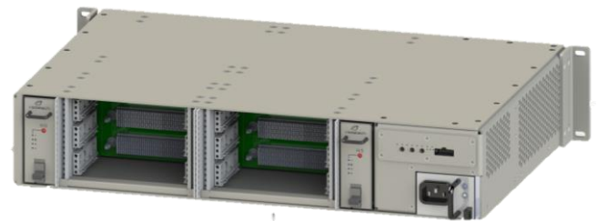
Figure 2: VTX880 Rear View